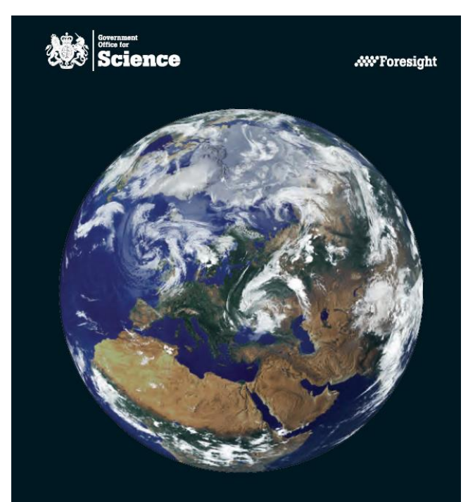
The Future of Food and Farming: Challenges and choices for global sustainability