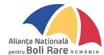
RONARD - Romanian National Alliance for Rare Diseases