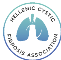
HCFA - Hellenic Cystic Fibrosis Association